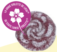
«La Vraie Violette de Liège»®