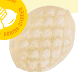
Honey / Lemon