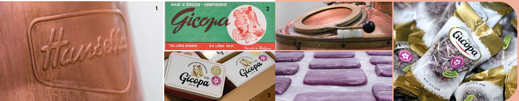
1 Hansella copper cooker 2 Gicopa advertising from the 1950's 3 vintage violette

We do not use gelatine and do not harm any animals : all Gicopa products are vegan.